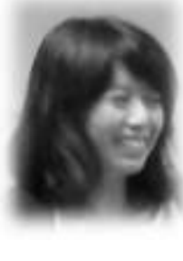
FERDINA TECHNOLOGY OFFICER